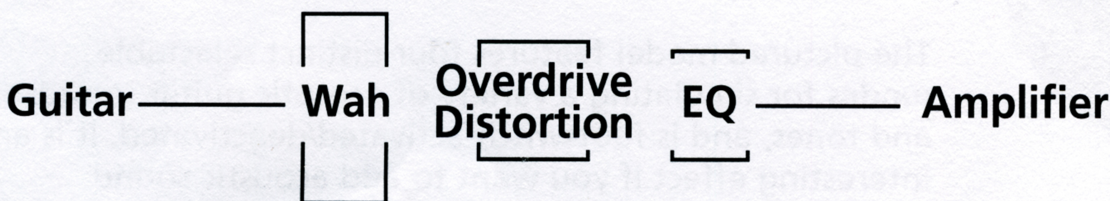
Basic Pedal Rig II