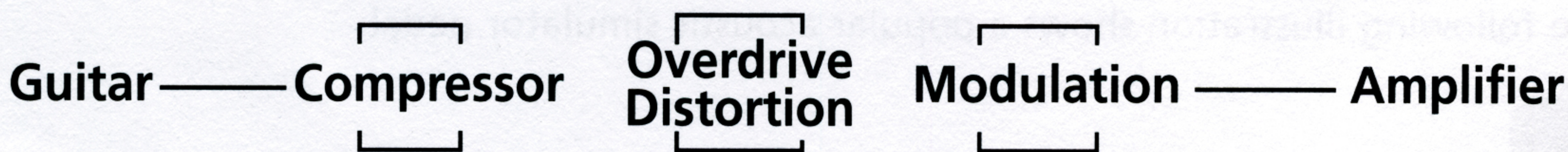
Basic Pedal Rig I

Check out the following basic effect pedal rig, which is effective for a number of stylistic situations: